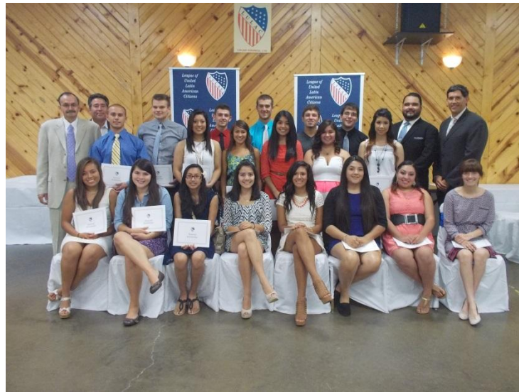
Congratulations 2014 LULAC Scholarship Recipients