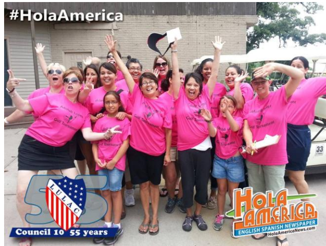
The LULAC Ladies