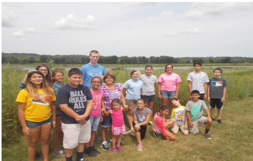
Nahant Marsh education Center Visit