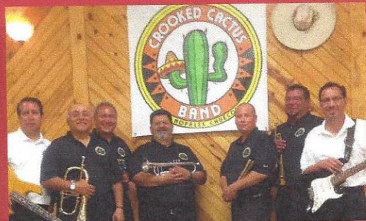
Crooked Cactus Band