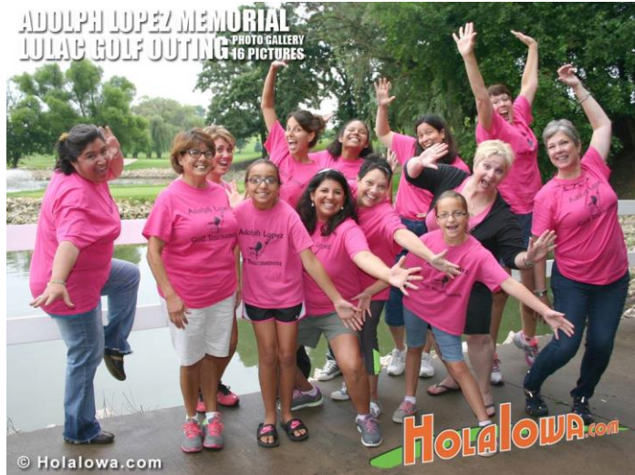
The LULAC Ladies