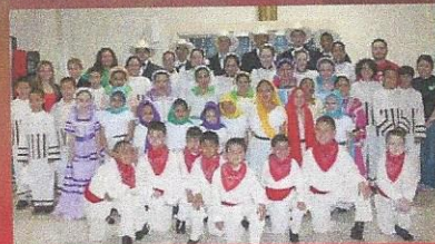
Quad Cities Ballet Folklorico