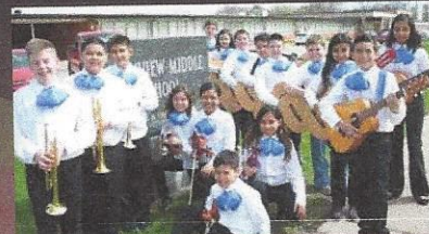
East Moline Glenview Mariachi Group

LULAC Center, 4224 Ricker Hill Rd., Davenport, IA