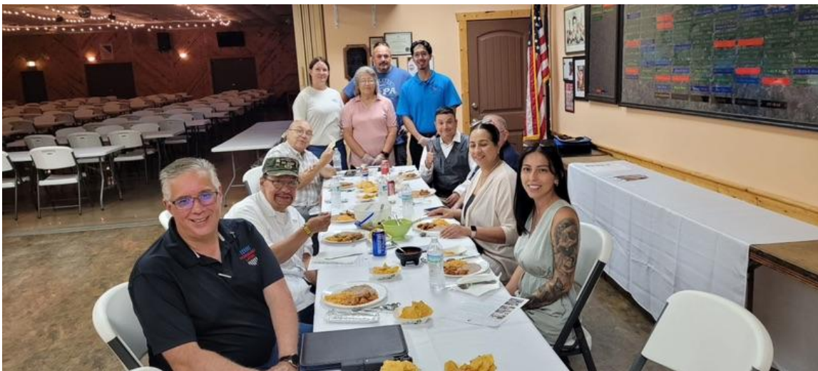
This past month LULAC Council 10 was honored to have Forward Latino bring a group of Latino Veterans from the Wisconsin area to visit Hero Street in