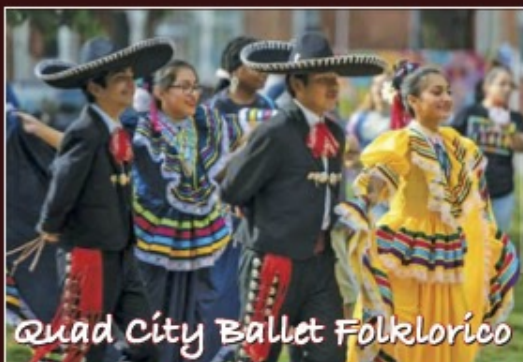
Quad City Ballet Folklorico