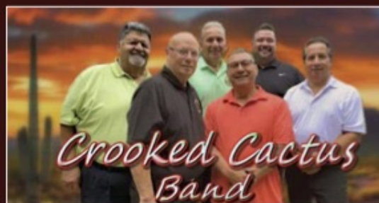
Crooked Cactus Band

PROCEEDS GO TO LULAC EDUCATIONAL PROGRAMS